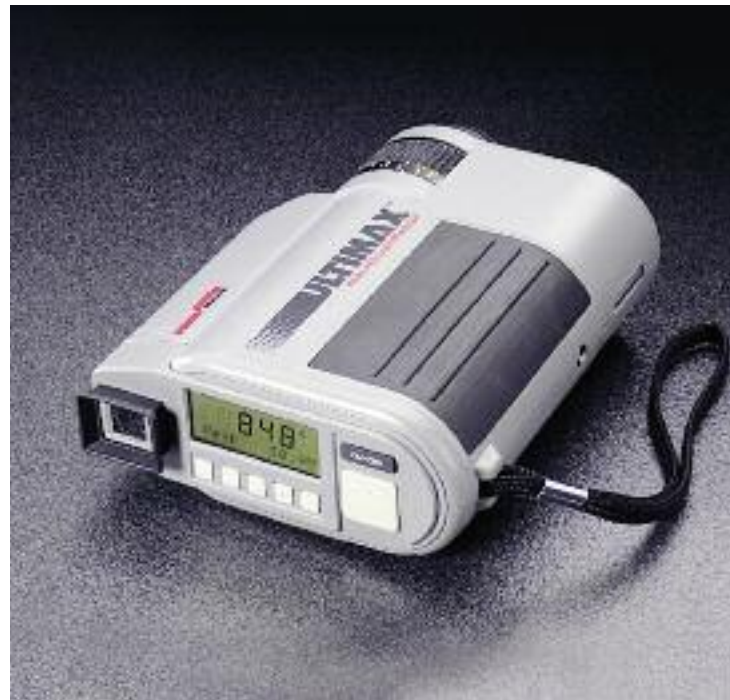
Models UX 10P, UX 20P, and UX 40P