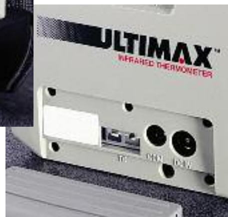
Models UX 50P, UX 60P, and UX 70P

to maintenance. No matter what your application, ULTIMAX Plus thermometers ensure consistent delivery of high quality finished products. For complete product details, please see the specification chart.