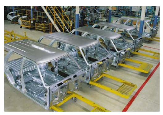
From paint curing to thermoforming, noncontact temperature measurement provides consistent product quality in the automotive industry.