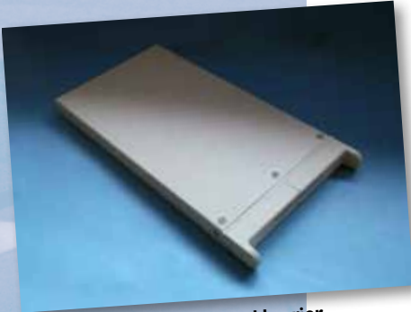
TB7528 low height thermal barrier