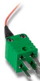
Vertical dual thermocouple plug