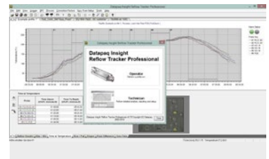
Datapaq Insight Reflow Tracker Professional Software

SPC (Statistical Process Control) calculations enable the technician to monitor oven performance over time and use the software to advise whether the profile will be out of tolerance in the future.