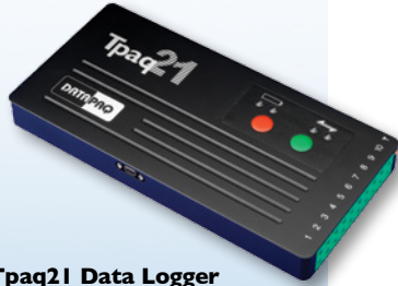
Tpaq21 Data Logger