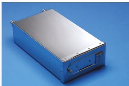
TB3049 thermal barrier