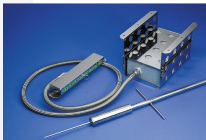
Thermal barrier with “in kiln” antenna