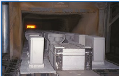
Kiln Tracker system in roller hearth sanitaryware kiln