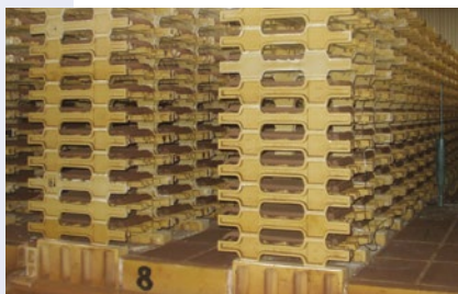
Kiln car equipped with high temperature antenna for RF telemetry