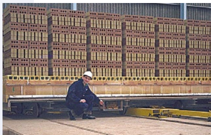
Kiln Tracker system beneath kiln car monitoring clay blocks

DATAPAQ® solutions for kiln profiling are specialized systems based on the kiln type. Tunnel kilns, clayblock firing, roller hearth kilns and hydro kiln solutions powered by Insight™ software for ease-of-use analysis have been the preferred method of profiling for leading manufacturers for many years.