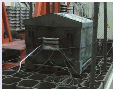
Vacuum carburizing process