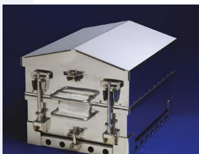
TB4500 with quench deflector

These thermal barriers incorporate several new design features, including additional strengthening at critical points, removable gas quench deflector shields and taper lock catches. Internally, the thermal barrier incorporates gas flow vents that allow fast pressure equalization, as conditions change from vacuum to high pressure within a matter of seconds.