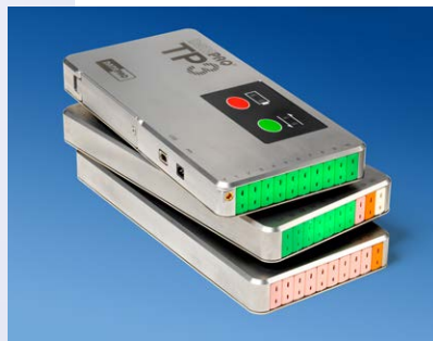
DATAPAQ TP3 data loggers