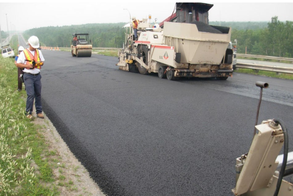
Taking asphalt temperatures during application.

"If asphalt is not applied at the right temperature it will cost much more in maintenance," Claude Boudrault of ITM explains. "Technically asphalt is supposed to last a certain number of years. However, if there are segregation problems from asphalt temperatures that are too hot or cold, then those years could be cut in half—and repairs are required much earlier in the cycle."