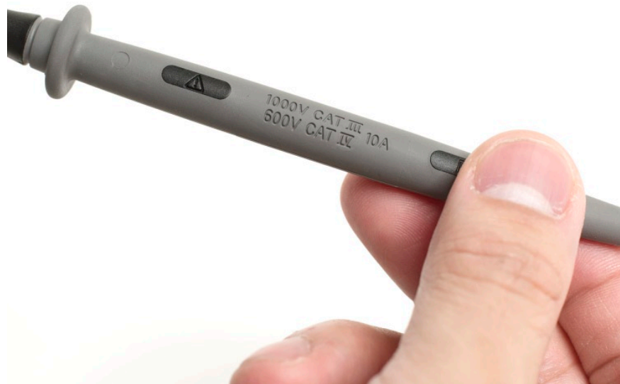
1000V CAT III, 600V CAT IV, 10A

The NFPA 70E standard also requires that the test tools used on the job be rated for the environment they will be used in. This applies to both the meter and the test leads/probes, and any PPE (Personal Protective Equipment) necessary for safe measurements. PPE ratings are somewhat different than CAT ratings, as illustrated in Table 2.